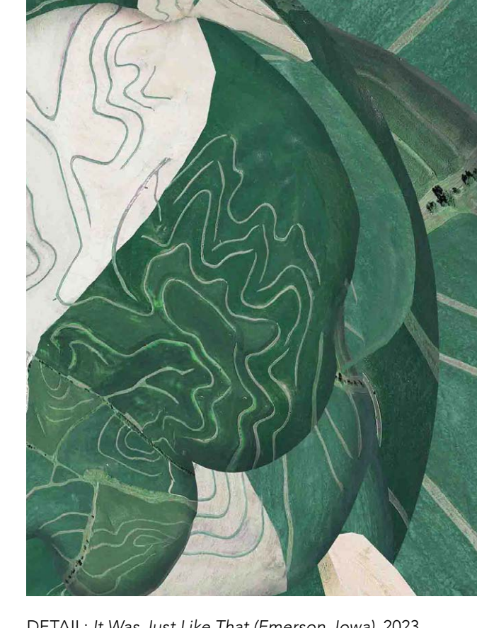
DETAIL: It Was Just Like That (Emerson, Iowa), 2023

is usually best with just us two, because I want to be fully in the landscape, not distracted by talking with another person. From an early age I just loved walking on a dirt path. Total freedom, no interference from others, fully engaged with the place.