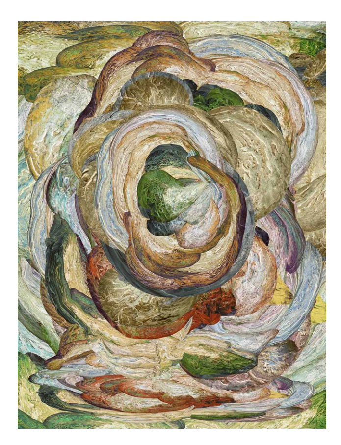
What Is That Thing (Corona, New Mexico, Version 1), 2023 archival pigment print on rag paper, 50" x 37.5", ed. 1/4