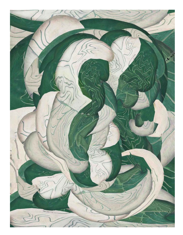
It Was Just Like That (Emerson, Iowa), 2023, archival pigment print on rag paper, 74" x 56", ed. 1/3

AR: I love moving through the landscape with my dog. It