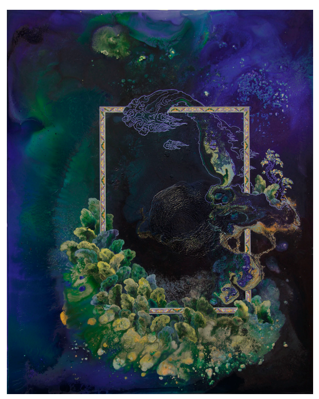
Hedieh Javanshir Ilchi, In the deepest , 2019 acrylic and watercolor on panel, 30" x 24"

From Persian painting and the art of Islamic illumination, Ilchi derives precise patterns and architectural elements. These intricate designs merge with the broad gestures of Western abstraction, particularly the pouring-paint technique associated with Jackson Pollock. "I like mixing those different systems together and creating a new hybrid," she says.