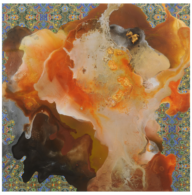
Hedieh Javanshir Ilchi, Bloodflood #3, 2019 acrylic and watercolor on panel, 16" x 16"

Beauty, the artist believes, sparks a seductive entry for viewers who she hopes will remain to contemplate more deeply. "I'm interested in changing the viewpoint, looking at a broader image of our world," she continues. "These painted patterns are beautiful, but there's a tension between the very different techniques.